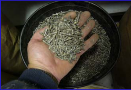
7084 Harlan Pelleted Paper