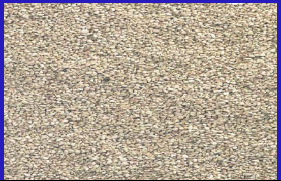
7097 1/4" Corn Cob Bedding