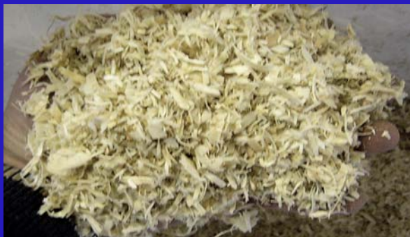
7082 Harlan Aspen Shavings