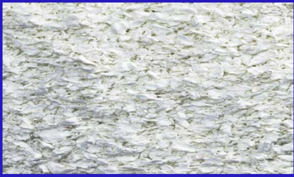
7099W Certified White TEK-Fresh