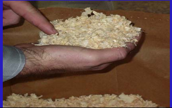
7088 Lab Grade Pine Shavings