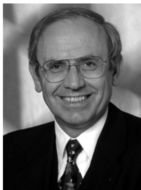
Dr. Hannes FARNLEITNER

Dr. Farnleitner is currently Adviser to the Federal Chancellor and former Federal Minister for Economic Affairs. Prior to that time, he was a member of the Economic and Social Committee of the European Communities, Vice-President of Agramart Austria (AMA), and Co-Chairman of the Economic and Social Council of the social partners.